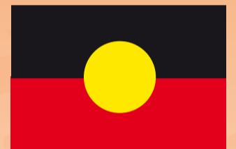
The Aboriginal flag, designed by Harold Tomas in 1971