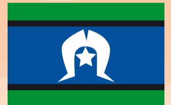
The Torres Strait Islander flag, designed by Bernard Namok in 1992